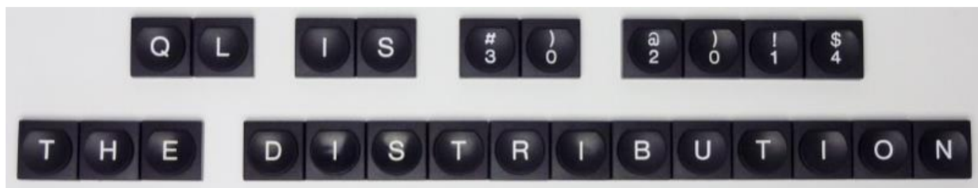
Pic 1. Logo of The Distribution, written with real QL keyboard keys

QL is 30 2014 - The Distribution Version 3 is the successor to the QL Today 2013 - The Final DVD which was sent out in September 2013 with The Final Issue of the QL Today magazine. The new version 3 holds everything which was on that “final” DVD, but has been carefully cleaned, updated and supplemented with new material. I have been able to add some real gems (e.g. long lost software) and an exclusive new release of a formerly commercial package! Details about that further down.