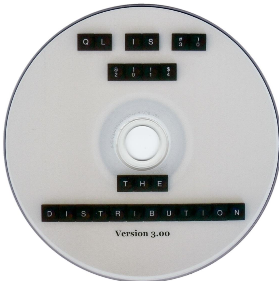
Pic 2. DVD edition of The Distribution

QL is 30 2014 - The Distribution Version 3 is the successor to the QL Today 2013 - The Final DVD which was sent out in September 2013 with The Final Issue of the QL Today magazine. The new version 3 holds everything which was on that “final” DVD, but has been carefully cleaned, updated and supplemented with new material. I have been able to add some real gems (e.g. long lost software) and an exclusive new release of a formerly commercial package! Details about that further down.