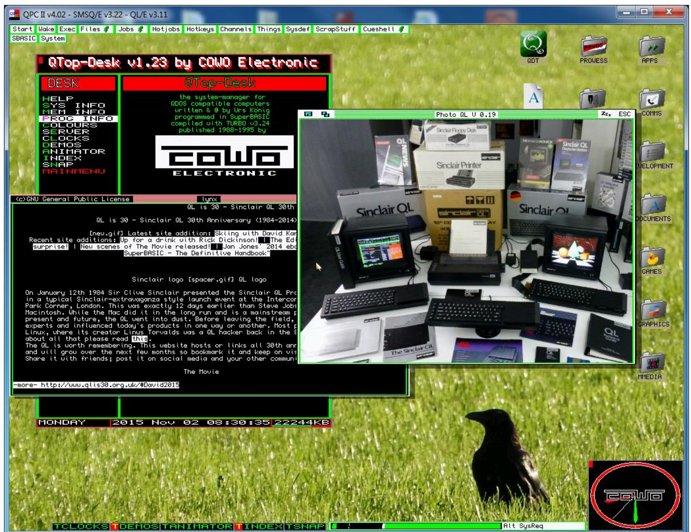
Pic 4. Running QL/E, showing the system-manager QTop-Desk, the web-browser lynx and a photo of a bit more than just a QL (heaven) on the desk(top) ;-)

QL is 30 2014 - The Distribution holds searchable PDF files of every published QL Today magazine and seven volumes of the QUANTA newsletter for you to read. Plus an awful lot of other QL related material for you to explore. Altogether there are about 4 GB of documents , software and pictures in this distribution. Preconfigured QL emulators for use under Windows, Mac OS and even Linux make it easy to bring the QL (back) to your desk(top) .